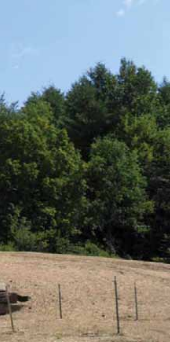
Current project on Howe Hill in Sharon, Vermont.

our pursuit of money, “we’ve lost a lot of sense of community and our connection to the land.” But clients who build a GeoBarn are making a statement about how they want to live, he continues. The building experience and the end product offer a way to reconnect to community and our agrarian roots. “Barns represent what we’ve lost and what we yearn for as a society.”