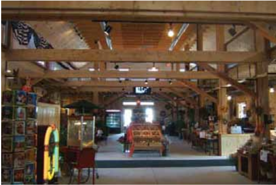
Commercial nursery and farmers' market in Westborough, Massachusetts.

the Steinway or serve as living quarters for the in-laws. Thanks to an open floor plan and super-strong support system in which “everything is going back into the sills,” some clients use their GeoBarn to garage and maintain their boat or specialty car—even on an upper level.