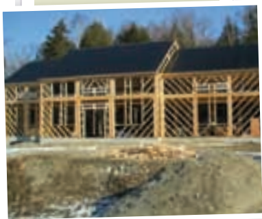
Top: Maine coastal home with matching garage.