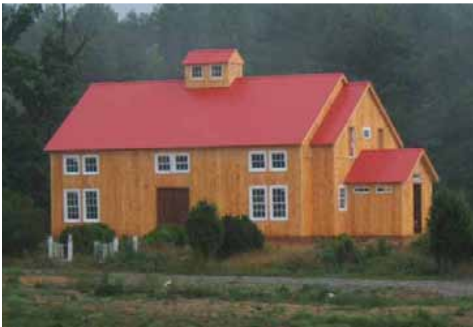
Rural home near Appomattox, Virginia.

The 60-year-old president and general manager of GeoBarns is also entirely transparent when it comes to his quotes. “I’m really open about money,” he says. “[My clients] know how much I’ll make.” He says he aims for a 20 percent profit