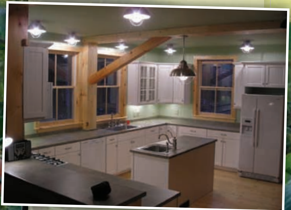
Left: A 150-acre farm in Cambridge, New York, features a GeoBarns workshop.